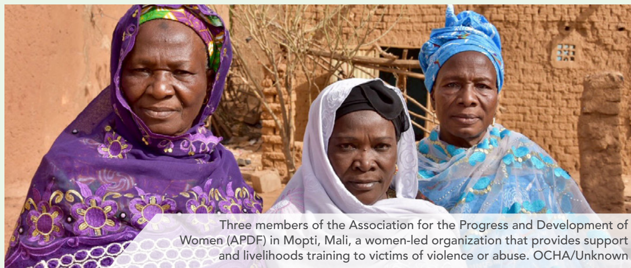
Three members of the Association for the Progress and Development of Women (APDF) in Mopti, Mali, a women-led organization that provides support and livelihoods training to victims of violence or abuse.

• Focus on practical steps to prevent sexual exploitation and abuse: Stakeholders emphasized the need to focus on practical steps for PSEA, such as coordination, inter-agency collaboration, raising awareness and developing easy-to-use reporting mechanisms that safeguard reporters and victims.