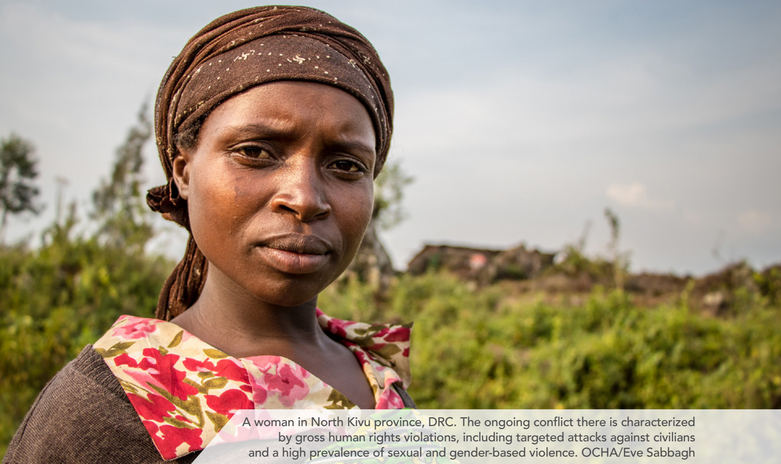
A woman in North Kivu province, DRC. The ongoing conflict there is characterized by gross human rights violations, including targeted attacks against civilians and a high prevalence of sexual and gender-based violence.

(IOM), which strengthened integration of GBV indicators in data collection on displacement, and UNICEF, which gathered data on ending violence against girls as part of its U-Report platform. 8