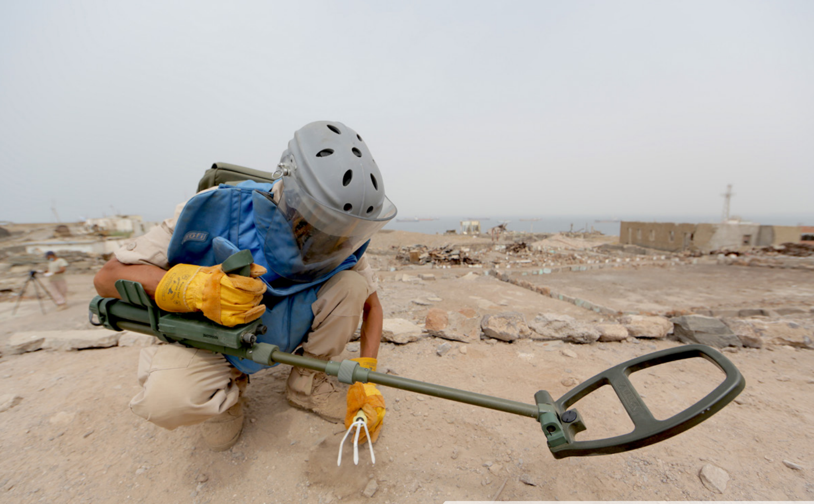
A man checks for mines and unexploded ordnance outside Aden, Yemen.

in Argentina in March 2017. Belgium, Canada and Slovenia were among 15 Member States that endorsed the Safe Schools Declaration in 2017. Save the Children reported providing advice to NATO on integrating the Safe Schools Declaration and the Guidelines for Protecting Schools and Universities from Military Use during Armed Conflict into NATO policy. Geneva Call conducted two training sessions with seven non-state armed groups on the protection of schools from military use and attacks.