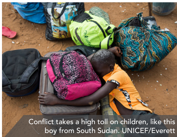
Conflict takes a high toll on children, like this boy from South Sudan.

Nearly a quarter of reports under Core Responsibility Two included efforts to enhance protection of children in conflict. Several focused on child soldiers, including Canada's report on launching the Vancouver Principles on Peacekeeping and the Prevention of the Recruitment and Use of Child Soldiers—which was endorsed by over 60 Member States. The 'Children, Not Soldiers' campaign run by the UN Special Representative of the Secretary-General for Children and Armed Conflict (SRSG CAAC) and the United Nations Children's Fund (UNICEF) concluded in 2017, resulting in eight countries 2 signing action plans to end and prevent the recruitment and use of children in conflicts. Geneva Call reported efforts to aid the release of