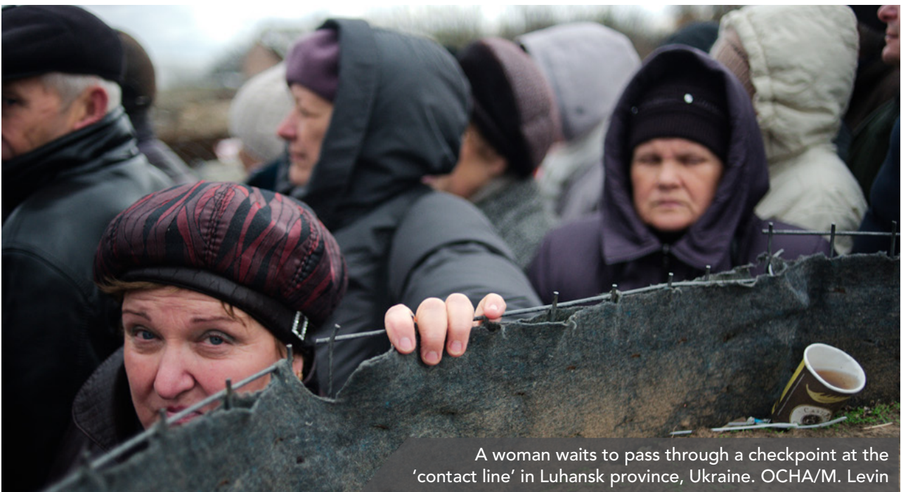
A woman waits to pass through a checkpoint at the 'contact line' in Luhansk province, Ukraine.

Reporting demonstrated the efforts of a committed group of stakeholders to uphold the norms that safeguard humanity and improve the protection of civilians in armed conflicts. The majority of reports from Member States and civil society organizations provided accounts of advocacy efforts to remind parties to conflict of their obligations, and to call for accountability for violations. Stakeholders also highlighted efforts to better protect the most vulnerable, in particular children, to eliminate the threat of landmines and other explosive weapons, and to safeguard medical personnel and facilities. Practical measures to improve compliance included improving data collection, conducting research, sharing best practices, capacity-building and training.